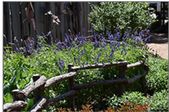
Mealy Cup Sage in bloom