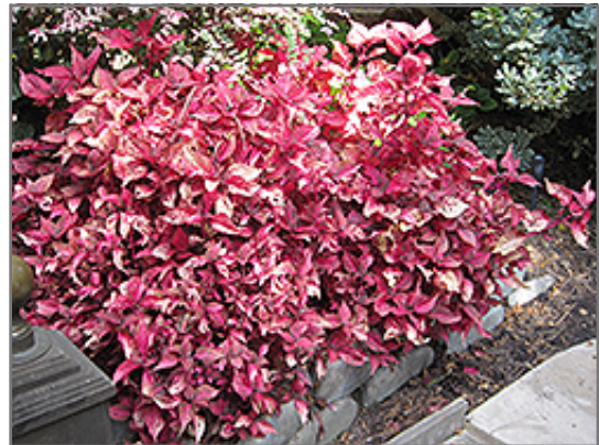
Blood Leaf