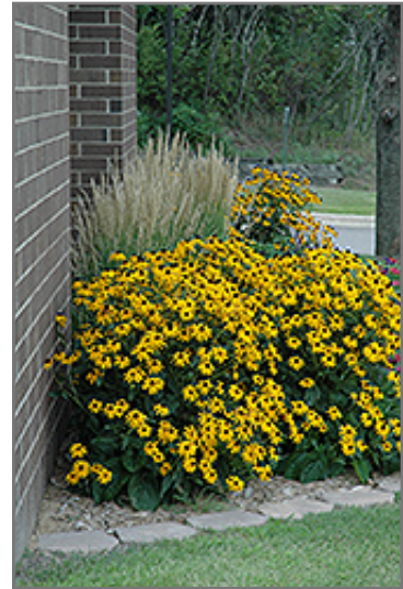
Goldsturm Coneflower in bloom