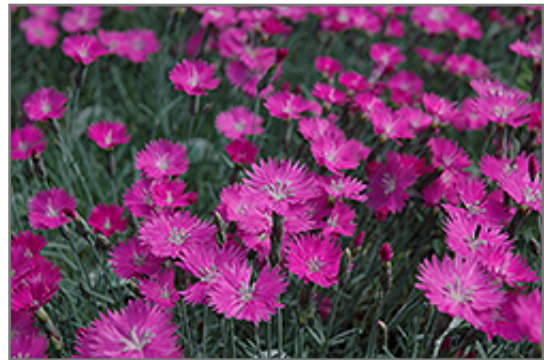
Firewitch Pinks flowers