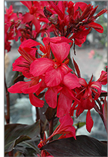
Australia Canna flowers