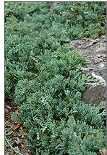
Blue Rug Juniper