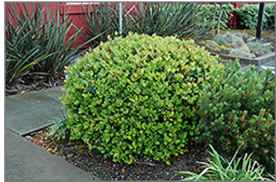
Dwarf Yeddo Hawthorn