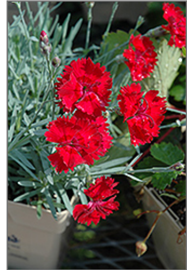
Fire Star Pinks flowers

Fire Star Pinks is recommended for the following landscape applications;