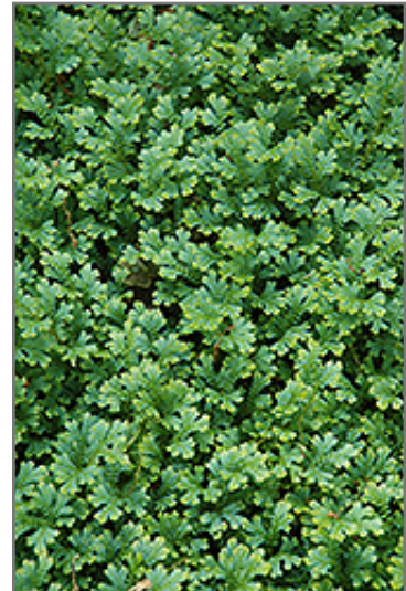
Peacock Spikemoss