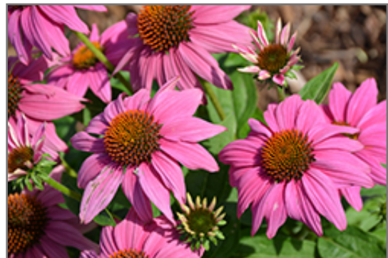
PowWow Wild Berry Coneflower flowers