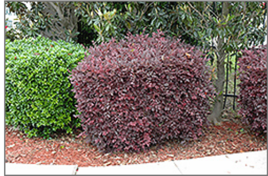
Purple Diamond Fringeflower

Purple Diamond Fringeflower is recommended for the following landscape applications;