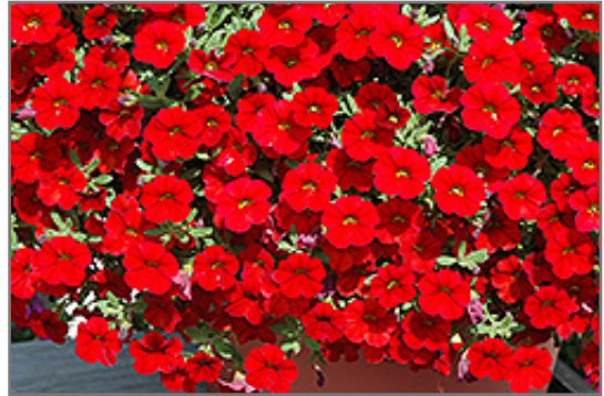
Cabaret Bright Red Calibrachoa flowers

Cabaret Bright Red Calibrachoa is recommended for the following landscape applications;