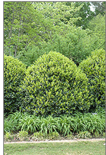
Needlepoint Chinese Holly