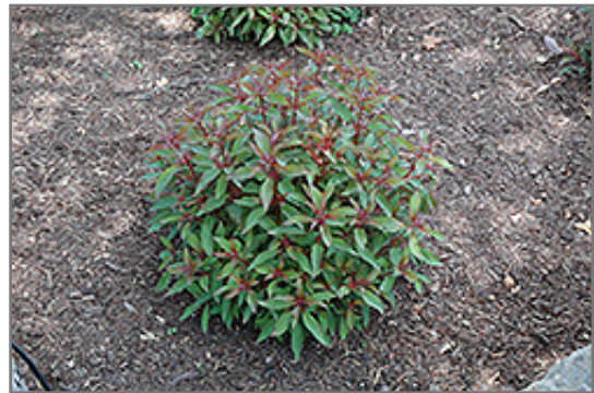
Scarlet Bush