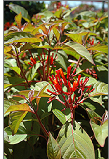
Scarlet Bush flowers

This is a relatively low maintenance shrub, and is best cleaned up in early spring before it resumes active growth for the season. It is a good choice for attracting butterflies and hummingbirds to your yard. It has no significant negative characteristics.