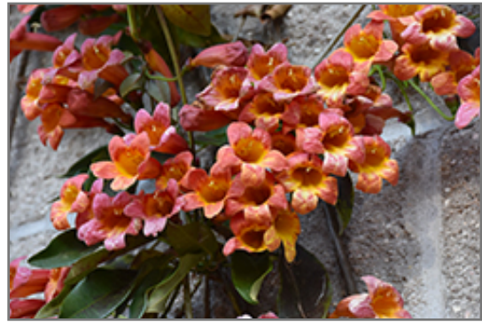
Tangerine Beauty Cross Vine flowers