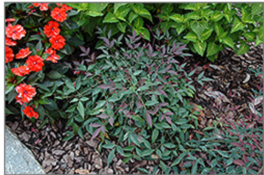
Flirt Nandina